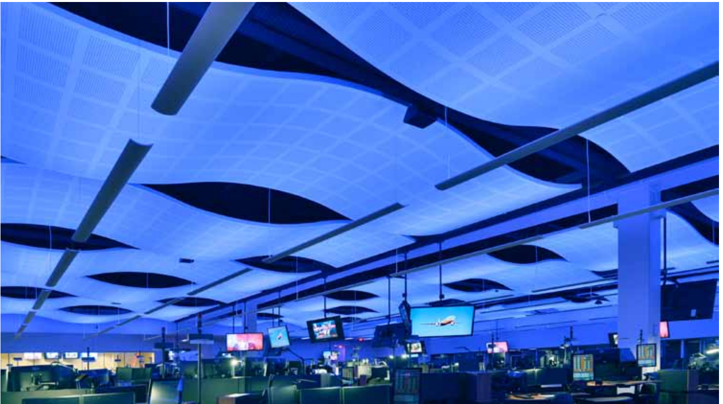
Southwest Airlines Training and Operational Support Building in Dallas, Texas